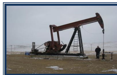
Daniel Vesco inspecting a well during site visit of acquisition candidate

ONE Energy continues to be highly selective in its search for oil and gas assets for its portfolio. Members of management visited potential prospects in Wyoming and Texas. Due diligence has been completed for the Wyoming property and acquisition negotiations are underway. ONE Energy is still going through the due diligence process for the Texas leases. However, both sellers want a large premium for their deals and as ONE Energy confirmed in Singapore, it seeks "good quality assets" and should not pay a significant amount for contingent resources.